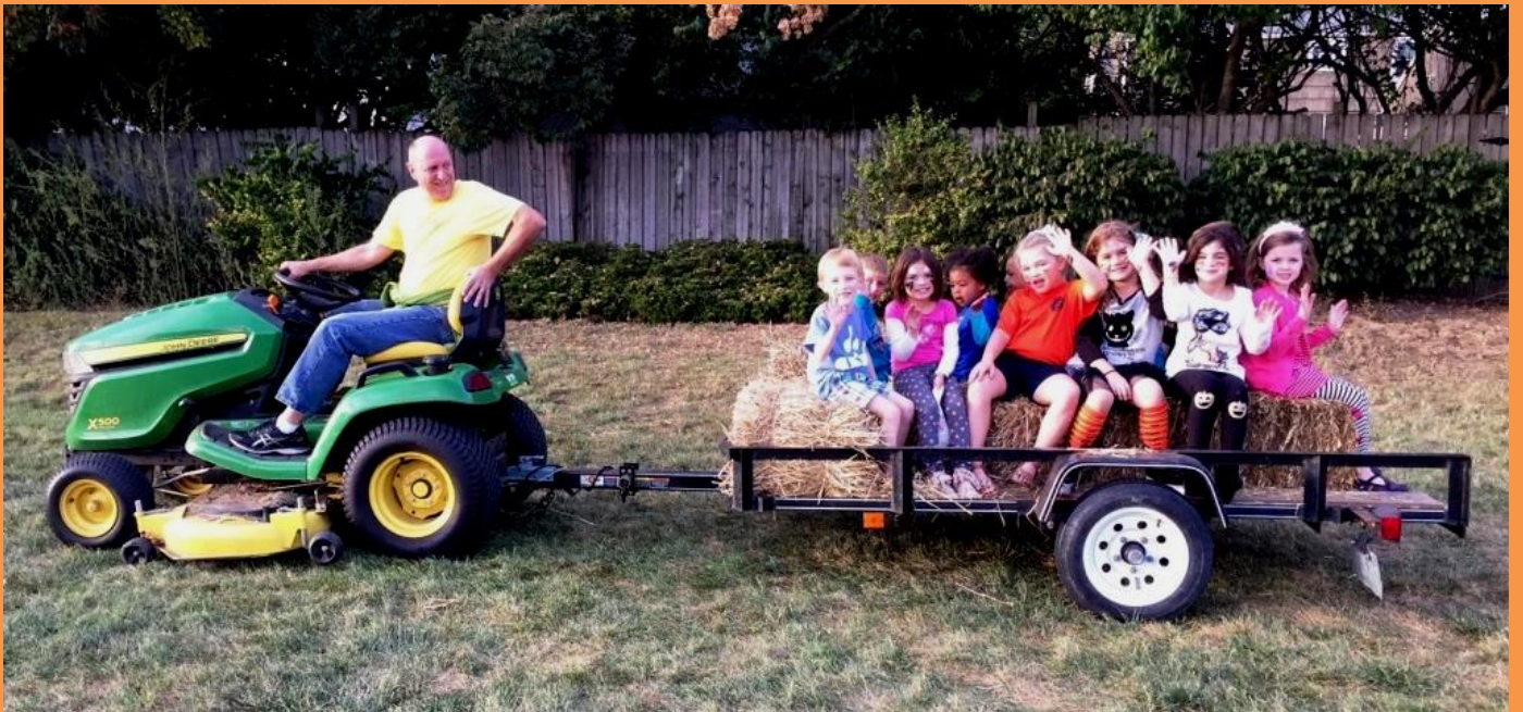
“All Aboard” for the Knight’s Hayride!